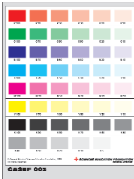
Figure 1. Color Gradient Transparency - Overlapping the CMYK transparency strips generates most of the colors produced by a color printer.

Additional aspects of subtractive colors can be demonstrated using the CMY filters in conjunction with a color wheel: each of the CMY wheel filters can be placed on top of the color wheel to show