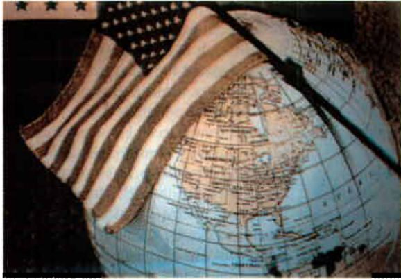
FIGURE 2. PHOTOGRAPH OF RECONSTRUCTED COLOR IMAGE USING BLUE-GREEN FILTER OVER THE SHORT WAVELENGTH RECORD. NOTE THAT THE ORIGINAL SCENE CONTAINED YELLOW AND GREEN IN BACKGROUND.

nearly identical wavelength ranges (roughly 450-630 nm and 460-655 nm, respectively). Land points out that our perception of brightness and color is generally unaffected by the vast range of illumination levels that we encounter in our visual scenery. A black object looks black and a white object looks white, even if the reflected flux from the black object exceeds that of the white object. He explains that the perceived brightness of a scene is normalized somewhere in the retina and cortex ("retinex") to the maximum reflected flux at any point in the scene. This brightness scale normalization is specific to each cone type (red, green, blue); it is independent of the normalization for the other cone types. 3